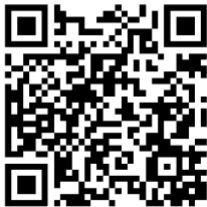
VMAA at ISU Payments

You do not need to have a PayPal account to use this process. Venmo is another option.