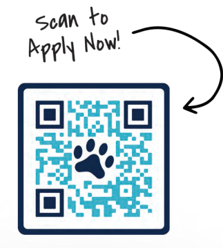
or visit go.svp.vet

SVP pays $500 weekly taxable for each student opportunity.