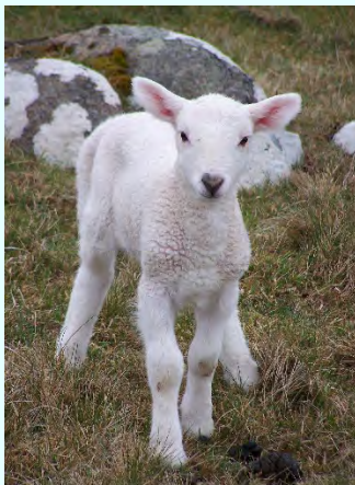
Animal of the month: Common Sheep Ovis aries

Contact us: http://www.acsindianola.com 515.961.7882